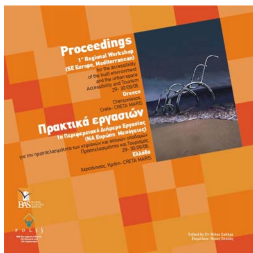
CONFERENCE PROCEEDINGS (English and Greek)

Provisionally available on November 2006